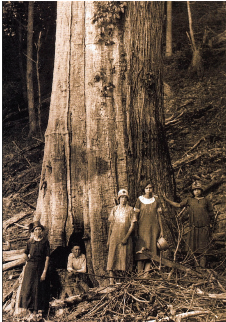
The American chestnut was once a giant within the eastern forests of the United States

To learn more about this organization's efforts, contact The American Chestnut Foundation at: www.acf.org ■