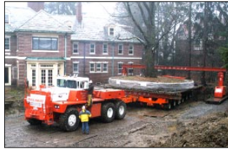
Technological innovations in tree moving are a result of improvement in equipment.

As we predicted, the critical activity ensuring the success of the transplant has been the ongoing after care program. The program includes monitoring soil moisture and fertility levels. Maintaining proper soil conditions is essential to ensuring transplant re-establishment. In addition, a special irrigation system was designed and installed within the tree's canopy to syringe the foliage and regulate transpiration rates. Other activities have included proper mulching techniques, as well as fencing to protect the regenerating root system from harm as the construction process continues. ■