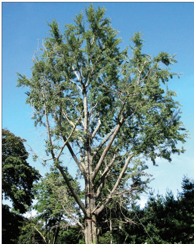
The Ginkgo two years after relocating to allow for construction