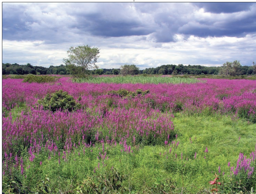
Purple loosestrife dominated the Charles River in Millis mid-summer