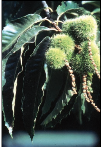
The goal of breeding is to produce fruit containing disease resistant genes

Fortunately, there are efforts underway to restore the American chestnut to its native range of the eastern United States. The American Chestnut Foundation, a not-for-profit organization, is dedicated to developing a blight-resistant American chestnut tree through scientific research and a unique breeding program. Their goal is to breed blight-resistance from the