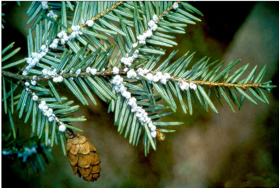
Hemlock woolly adelgid is a small insect, with a white cottony covering, producing two generations each year

Our advice is to regularly inspect your hemlocks for presence of white, cottony masses on the undersides of needles. We also recommend keeping bird feed away from hemlock whenever possible, to help prevent birds from carrying hemlock woolly adelgid to your trees. Contact us to develop a treatment program if you suspect the presence of hemlock woolly adelgid. 🍃