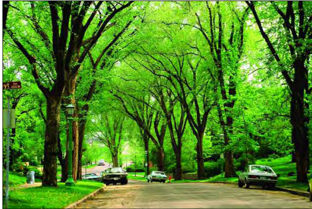
America's streets were once commonly lined with majestic American elms

With so many trees planted in such close proximity, the plague easily spread, not only by the beetles but also by root grafts between trees. The winds of the 1938 hurricane helped to distribute the beetles into new areas. Within decades thousands of trees were dead. Streets that were once covered by a cascading canopy became lined with blighted trees. It was such a traumatic change to entire communities that it ranks as one of America's greatest environmental losses.